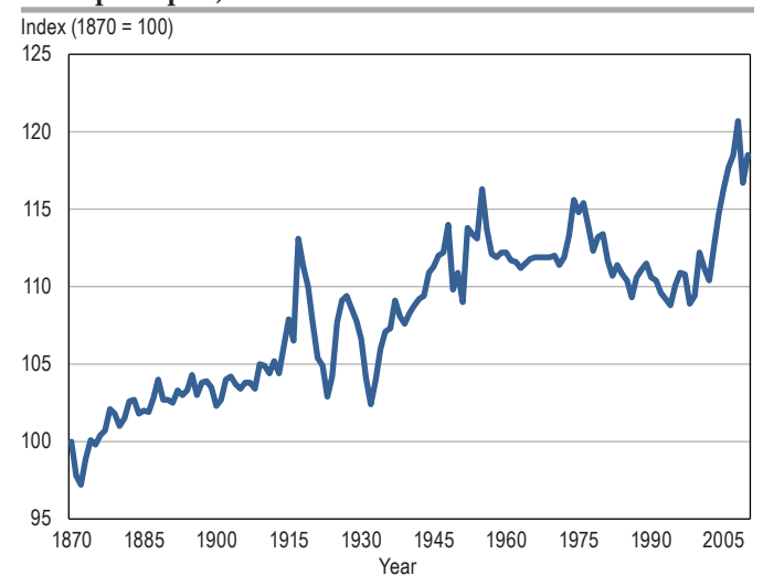
Chart 2 Cumulative gain in real GNI per capita relative to real GDP per capita, 1870 to 2010

Note: GNI: gross national income; GDP: gross domestic product.